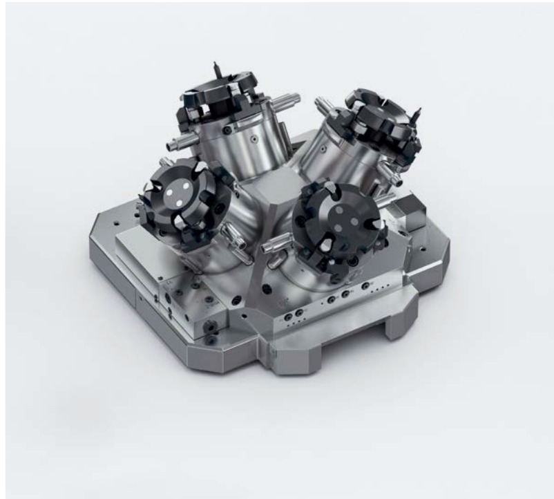
Example of multiple clamping

Our technical consultants make application-specific recommendations for optimising your production steps. In this way you maximise main times and reduce unproductive secondary times to a minimum.