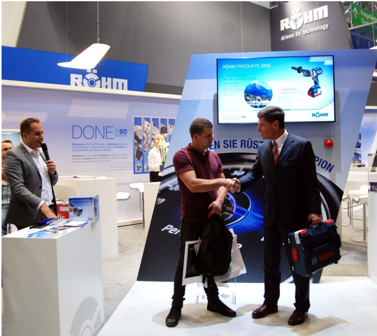
Fig. 2: The absolute record time was 10.27 seconds for a jaws change on the new DURO-A RC power chuck. In the picture: Röhms CEO Gerhard Glanz congratulates the winner and presents the prize of the day, a Bosch Professional Cordless Drill/Driver.