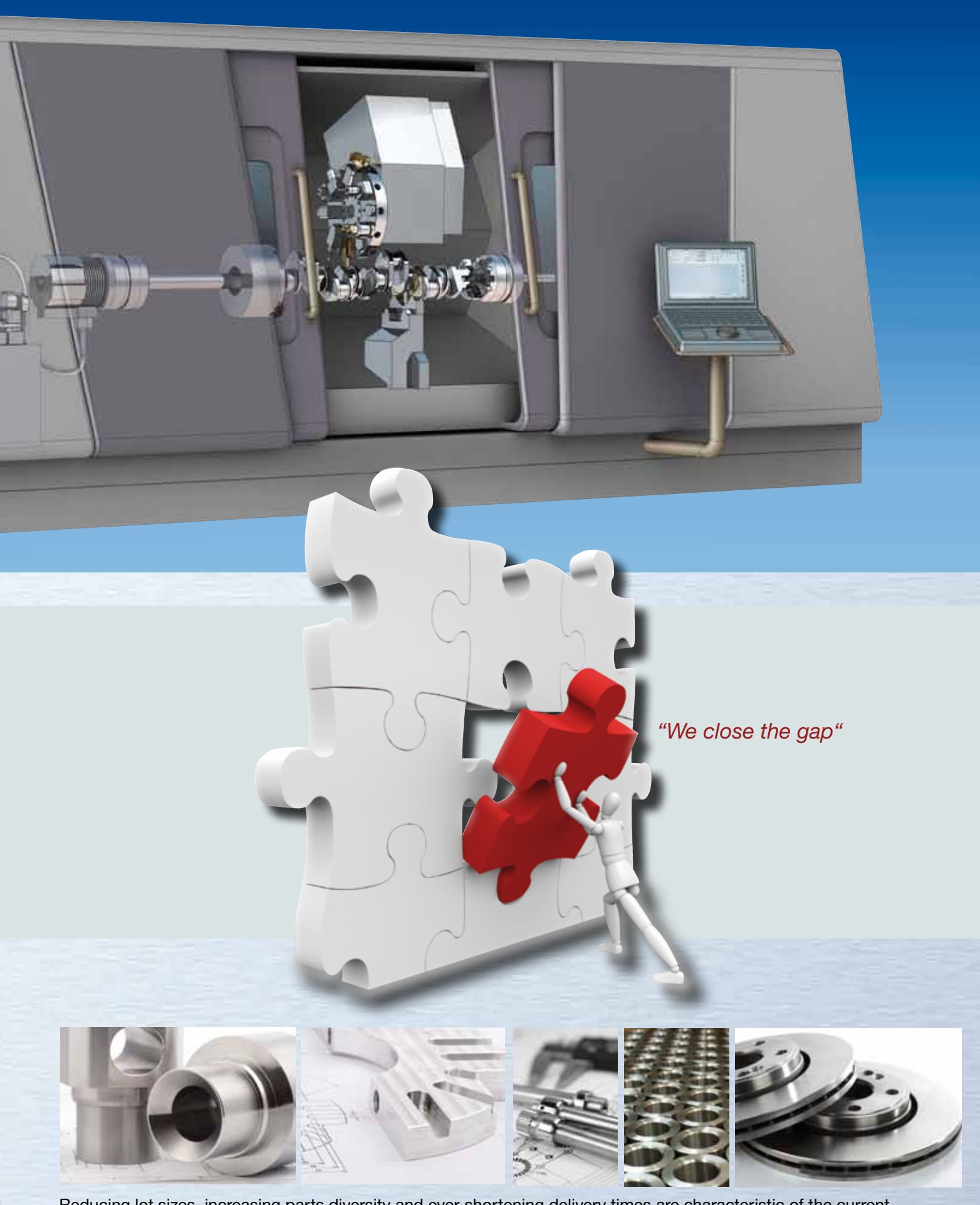
Reducing lot sizes, increasing parts diversity and ever-shortening delivery times are characteristic of the current situation in industrial producing companies. A significant improvement of efficiency can often be achieved simply by retrofitting existing machines.