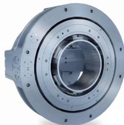
RÖHM swivel chuck for manufacturing bushings