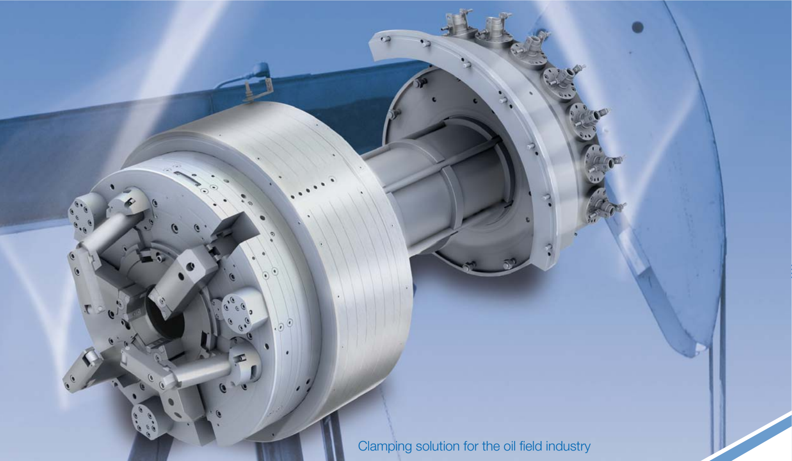
Clamping solution for the oil field industry