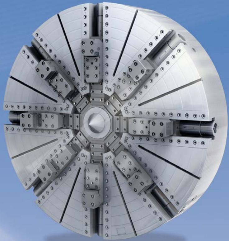
Clamping solution for power plants and steel mills