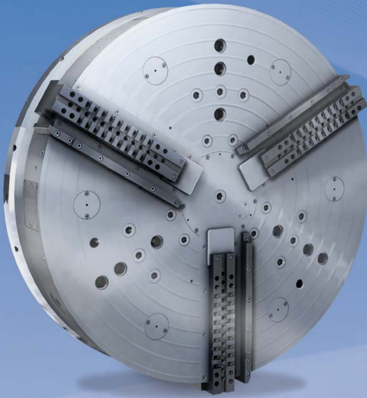
Clamping solution for rail traffic